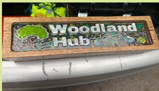
A sample of a sign made out of bottle tops

The Mayor of East Staffordshire also invited the 12 finalists to attend an Insignia at the Town Hall to congratulate them on their efforts. The calendar will be available to download on our website soon.