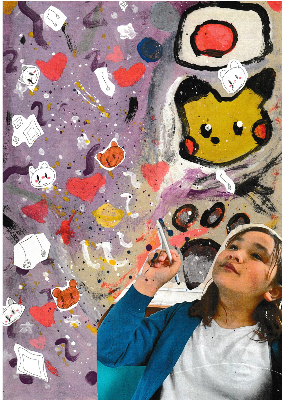
A pupil from Tower View Primary School